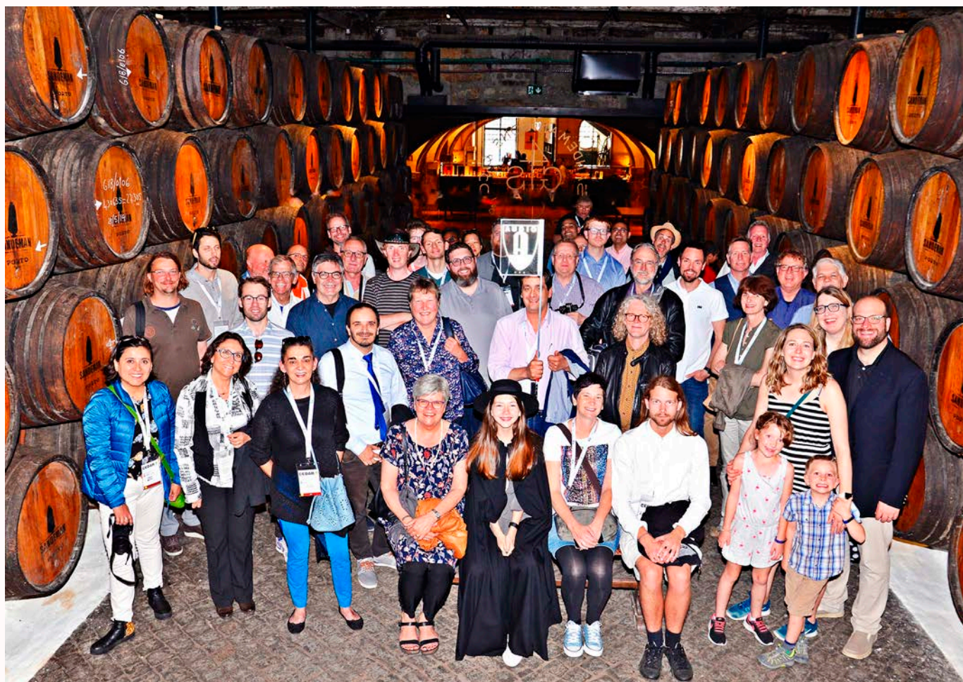
Delegates and their entourage gather for a group photograph at the Sandeman wine cellars.

Editor's note: AES Members can access the conference papers free of charge via the AES E-library at http://www.aes.org/e-lib/ or http://www.aes.org/publications/conferences/?confNum=ID-192