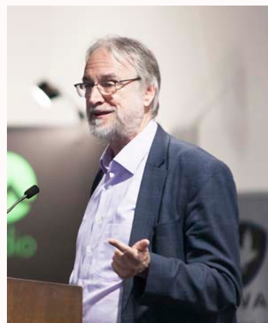
Karlheinz Brandenburg—opening keynote speaker