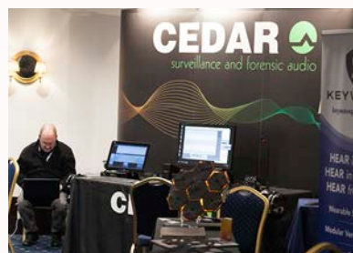
Platinum sponsors Oxford Wave Research (left) and CEDAR (above).

Thus, Lacey recommended the importance of understanding the native metadata structure when attempting to assess the likelihood that an iPhone audio file purported to be original might actually have been edited or otherwise manipulated.