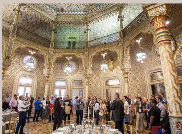
Venues for the evening social event: clockwise from the top, the Sandeman Port wine cellar, the Bolsa Palace, and the Dom Luís I Bridge.

spreading loss, refraction, attenuation, etc., but the forensic question can often involve the likelihood that a particular sound would be detectable by an average listener under some specified geometrical distances and meteorological conditions. This sort of investigation will have to include models of psychoacoustics and human perception.