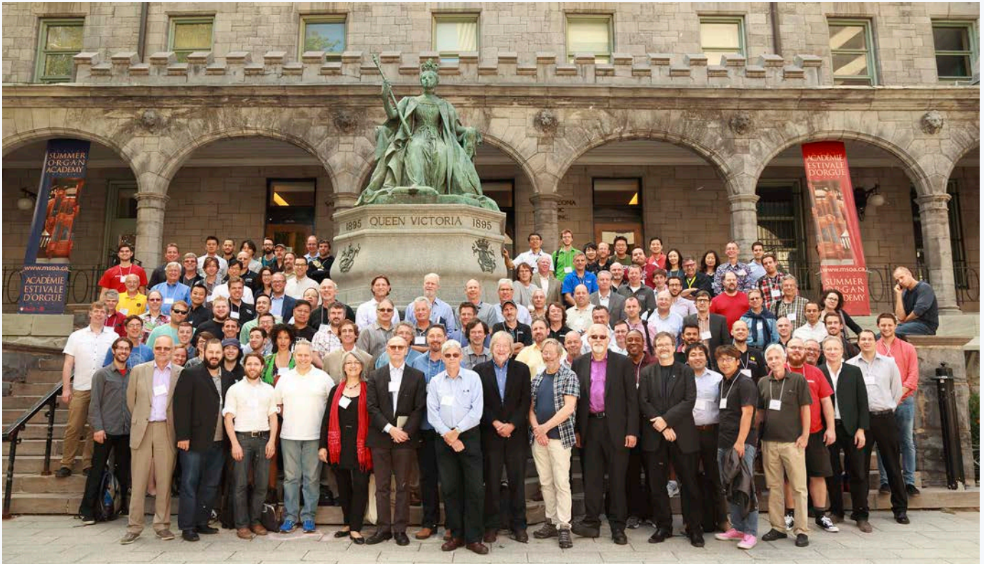
The assembled conference attendees holding court with Queen Victoria outside the Schulich School of Music