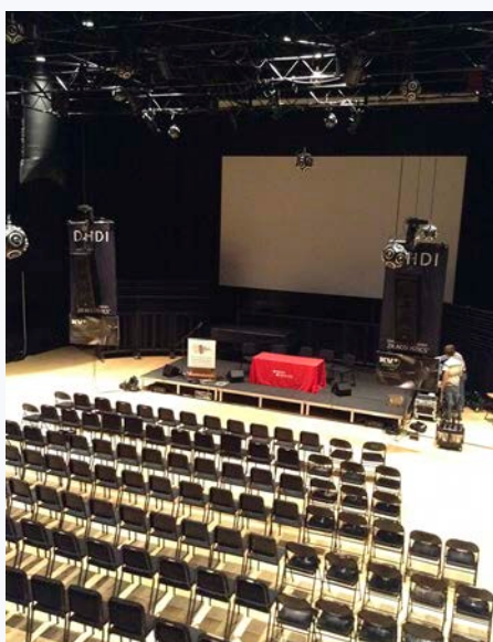
The Multi Media Room or MMR hosted most of the panel discussions and demonstrations