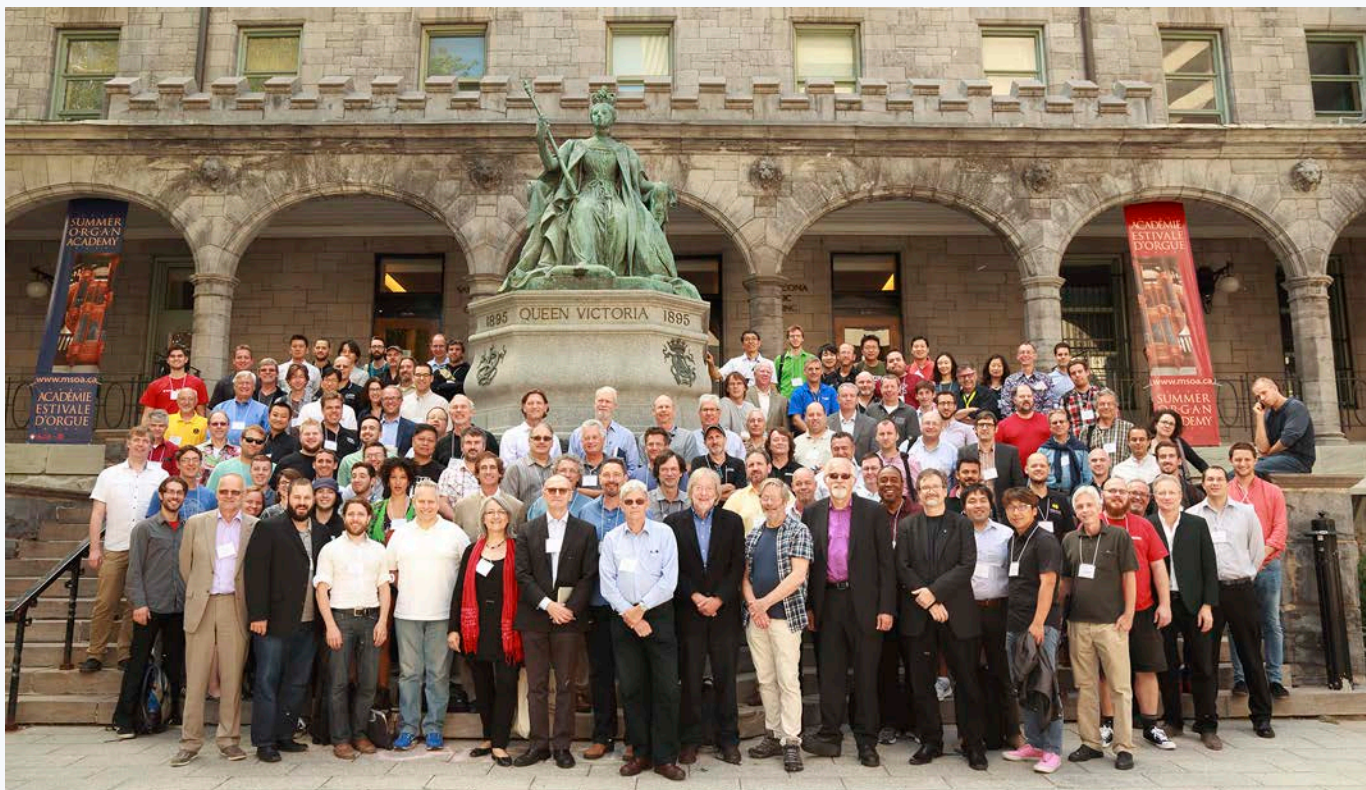
The assembled conference attendees holding court with Queen Victoria outside the Schulich School of Music.