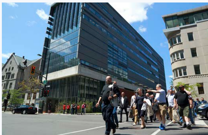
A tour heads off from the Elizabeth Wirth Music Building at McGill.