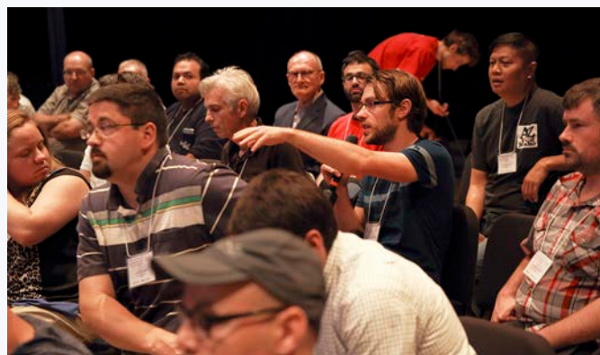
An audience member poses a question during lively discussions.