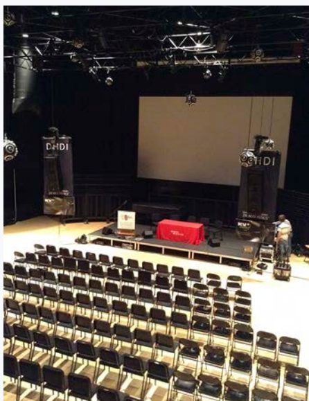
The Multi Media Room or MMR hosted most of the panel discussions and demonstrations