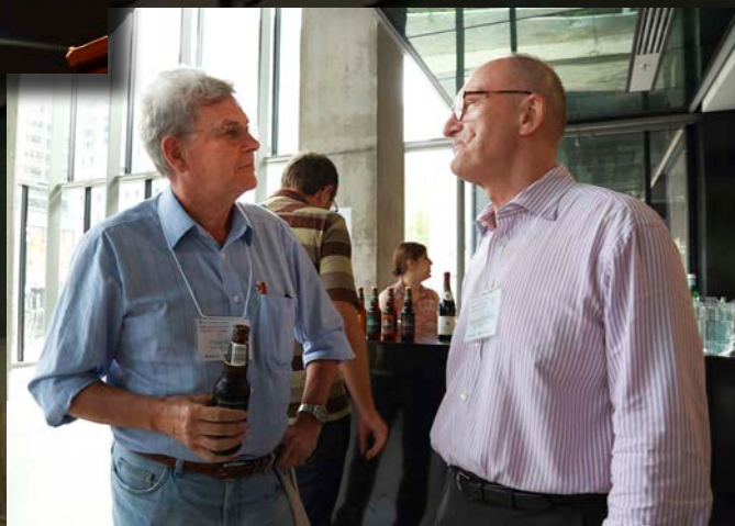
The conference chairs enjoy a beer during the informal reception before the conference starts.