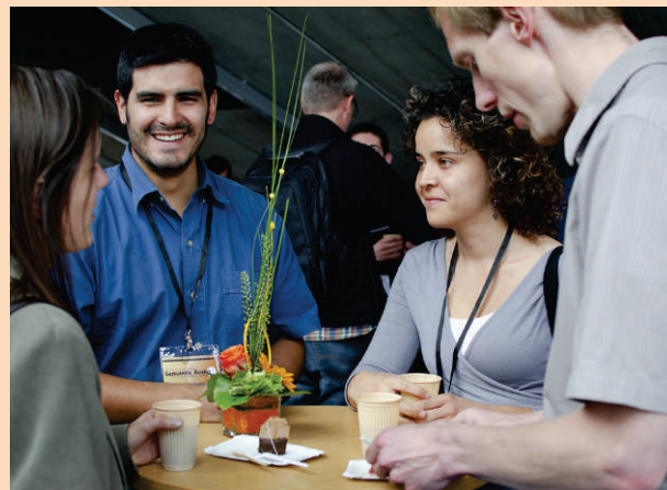
Delegates enjoy getting to know each other over coffee.

becoming more important in object-oriented audio coding, editing, and processing. Recent product releases demonstrate this, but many more innovative functionalities are becoming available.