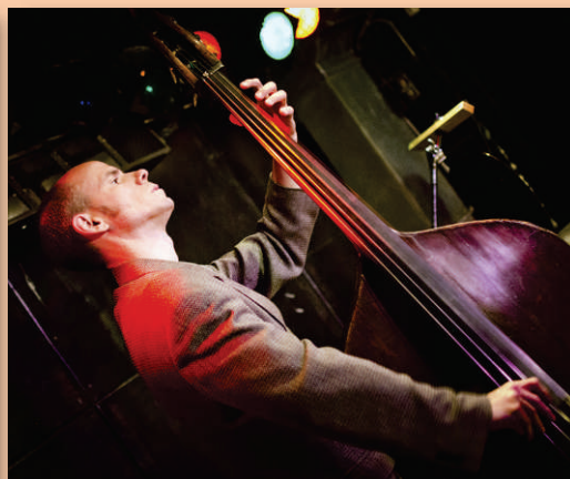
The band plays on during an enjoyable evening of entertainment.