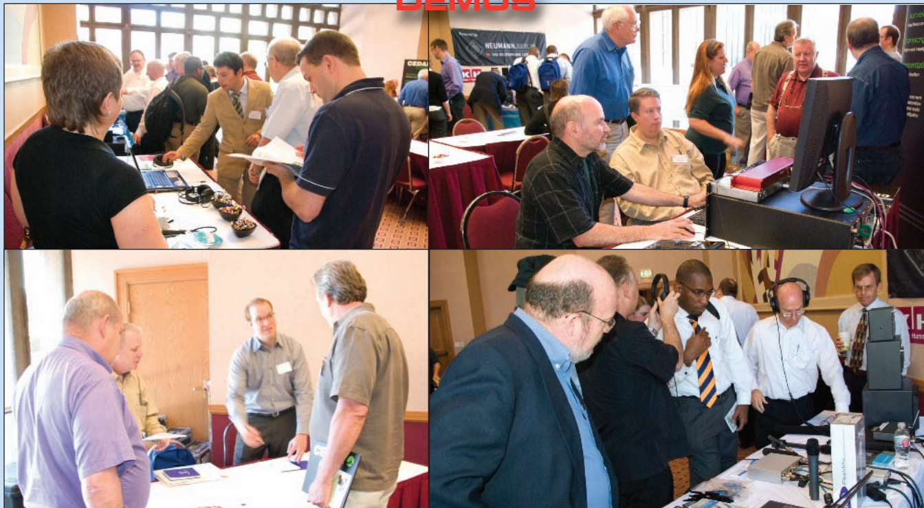
Exhibitors giving demos included IAS Forensics, CEDAR Ltd., Speech Technology Center, Digital Audio Corp., Sennheiser and Klein-Hummel, and the National Center for Media Forensics.