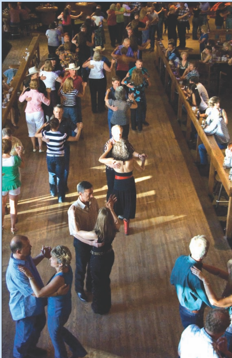
Attendees enjoyed the festivities at the banquet on Friday night at Denver's Stampede restaurant and nightclub.

The examiners in private practice almost always publish a rate sheet for their services, typically ranging from $200 to $400 per hour. Tom Owen recommended that private examiners operate in a completely business-like manner, and always “get the money up front” to avoid misunderstandings later.