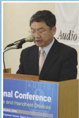
Keong-Mo Sung president-elect of the Institute of Electronics Engineers of Korea