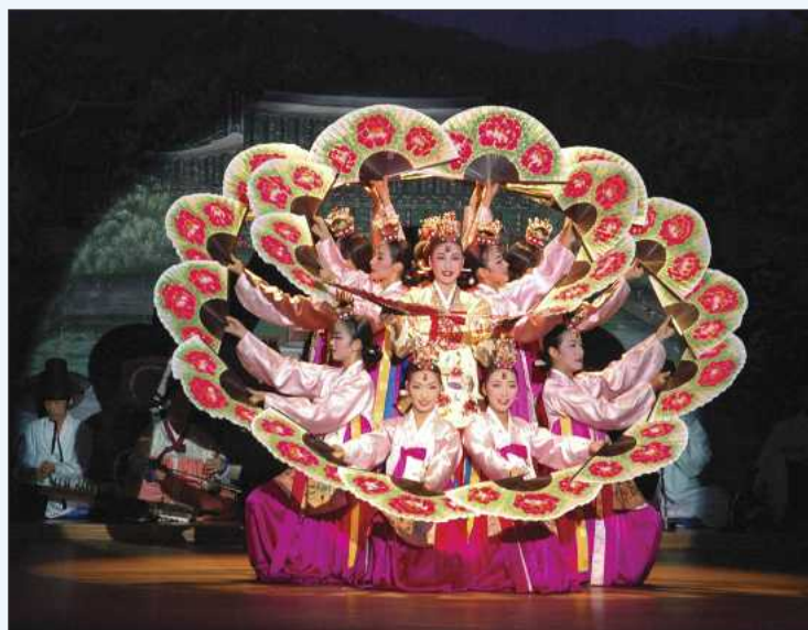
On Sunday attendees visited Korea House for a delicious banquet of Korean food and an evening of traditional Korean song and dance. A beautiful fan dance was just one of the authentic recreations of Korean culture that attendees enjoyed.