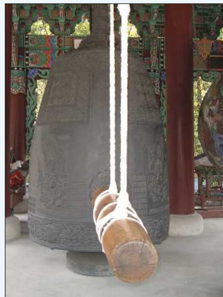
Sunday's excursion included a visit to Jogyesa Buddhist temple, at which this huge bell is rung twice a day to summon worshippers.