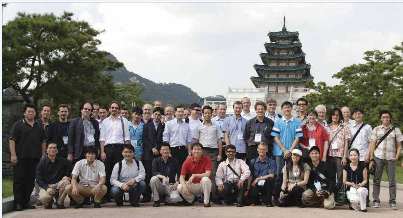
During the short walk from the National Folk Museum of Korea to Kyeongbokgung Palace, attendees pause for a group photo.

Editor's note: The conference proceedings and CD-ROM can be purchased online at www.aes.org/publications/conf.cfm .