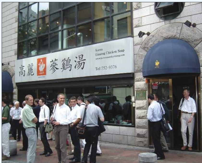
During Sunday's excursion in Seoul, attendees enjoyed lunch at a restaurant famous for its ginseng chicken soup.

the complete mobile audio framework, from audio codecs to audio middleware, from platform architecture to hardware, he provided a succinct explanation of the critical issues faced by the makers of complex multimedia handsets.