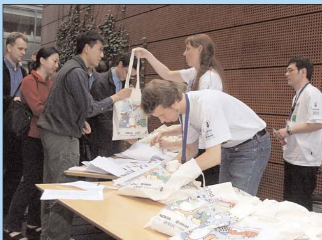
Delegates check in at registration desk.