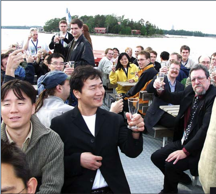
Delegates enjoy toast on boat ride to Suomenlinna Island.