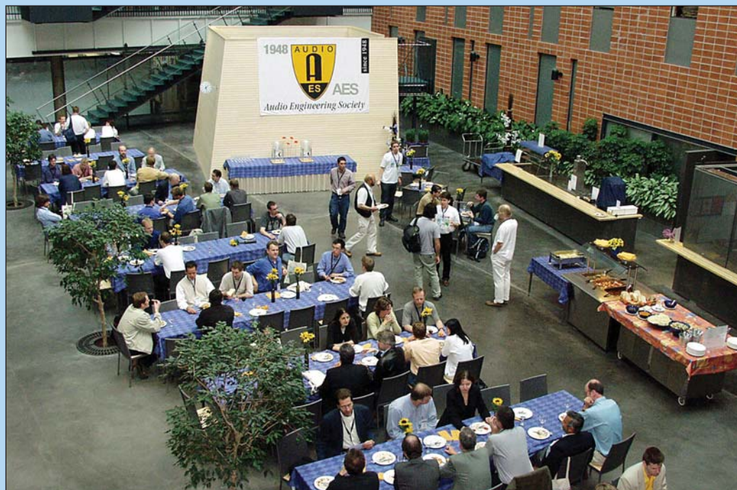
Excellent lunches were enjoyed throughout conference at Helsinki University of Technology.