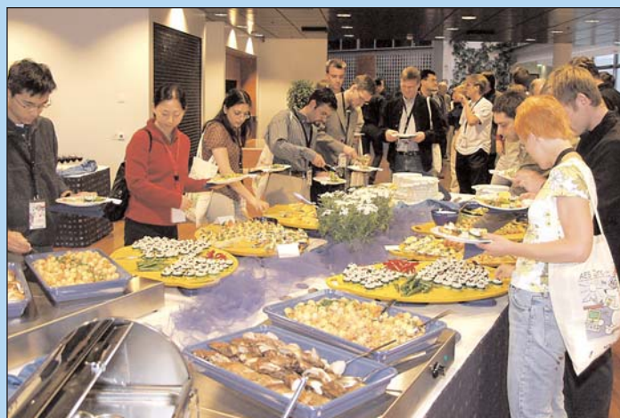
Friday evening welcome reception at Nokia Research Center