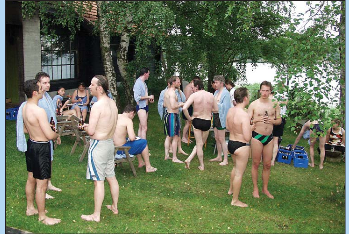
Finnish Experience: after exhilarating saunas and refreshing swim in Gulf of Finland, delegates enjoy barbecue at Finnish Sauna Society.

barbeque provided abundant nourishment for repeated sauna-swims.