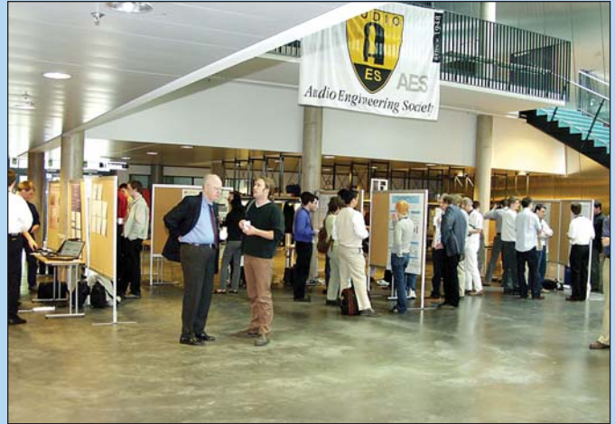
Numerous, high-quality papers on display at Sunday afternoon's poster session offer delegates more food for thought.

a tendency for the auditory judgments of listeners to be elevated compared with the visual stimulus; also the trajectories of sources tended to be pulled toward the loudspeaker positions. They found that localization blur was greater with panned sources than when originating from a single loudspeaker, which is not unexpected.