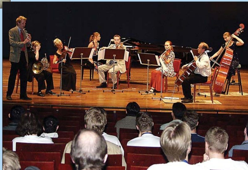
Musical highlight of conference was concert at Helsinki Conservatory by students from Sibelius Academy.