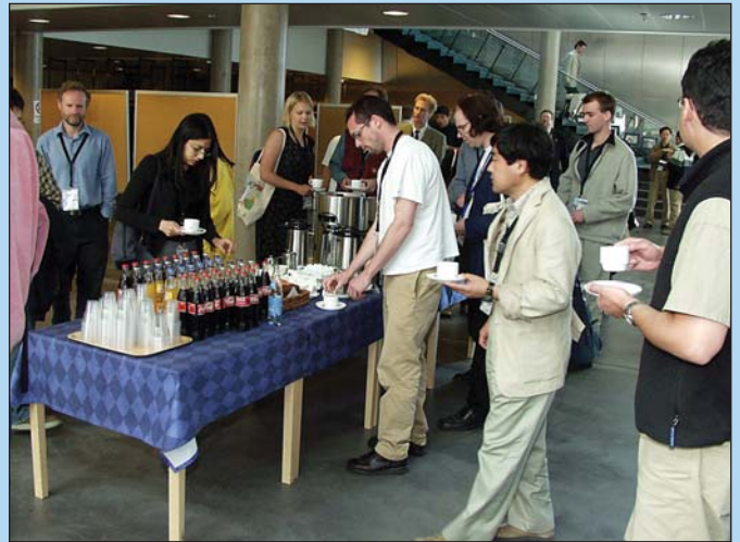
Delegates enjoy refreshments at coffee break.

Computational auditory scene analysis (CASA) is said to be the analysis equivalent of virtual reality (VR) which is concerned with synthesis of scenes. Both deal with a parametric version of the world. CASA requires cognitive models of human perceptual processes, and ➡