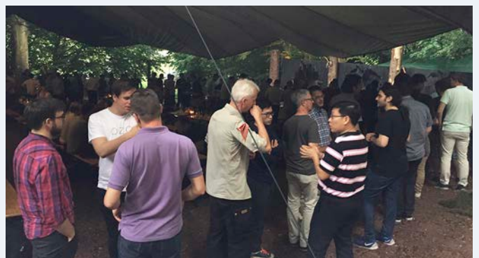
The robbers' camp in the middle of Rold forest.