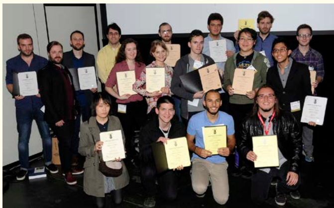
A happy band of student competition winners with their certificates