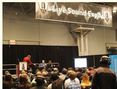
The Live Studio Expo draws a crowd.

With the Live Sound Expo (LSE), the 139th Convention offered expert advice for the broad spectrum of live sound engineers (some 25% of convention attendees) with an emphasis on the practical. It brought professionals with decades of experience to the stage