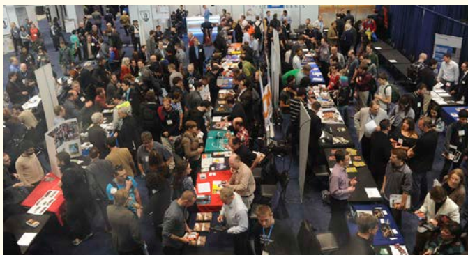
The Education Fair throngs with visitors eager to find out about audio training opportunities.

advice. Hosted by SPARS in cooperation with the AES Education Committee and G.A.N.G., career related Q&A sessions were offered to participants in a speed group mentoring format. A dozen students interacted with 4–5 working professionals in specific audio engineering fields or categories every 20 minutes. Audio engineering fields included gaming, live sound/live recording, audio manufacturer, mastering, sound for picture, and studio production.