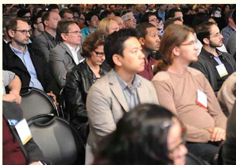
An overflow crowd listened to the awards and keynote presentations during the opening ceremonies.