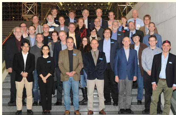
The AES Board of Governors met on the last day of the 139th Convention.