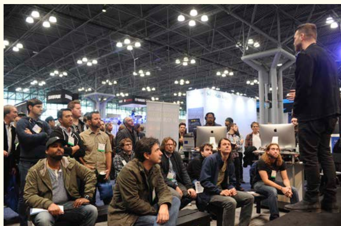
One of the many product demonstrations taking place during the show