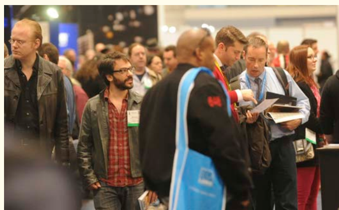
Busy visitors figure out where to go next on the exhibition floor.

are interpreted by the brain, and we perceive a small subset of the "real world." Our visual data is sparse, for example, but the brain builds for itself the most likely model of the world, based on