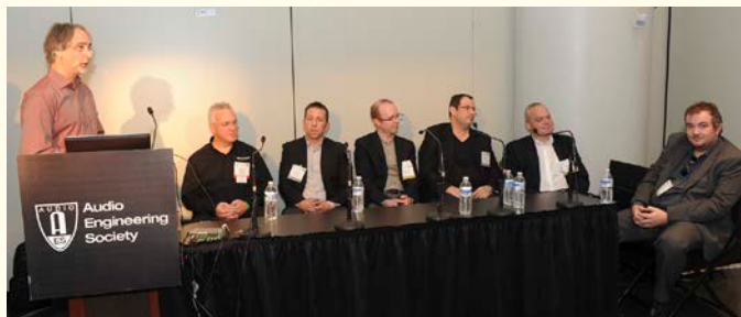
Network audio specialists keep the audience up to date with developments