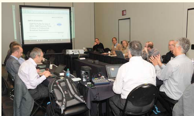
A busy standards meeting on network audio systems in progress