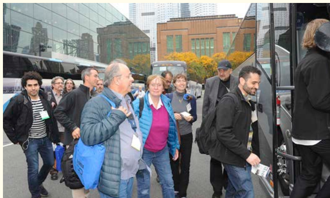
A group boards the bus for one of the many interesting tours.