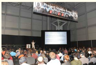
The Project Studio Expo in full swing

The traditional paradigm of transmitting audio and video media