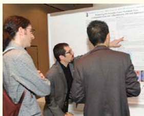
Delegates gather around an interesting poster.