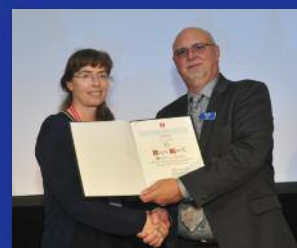
Citation: Bozena Kostek