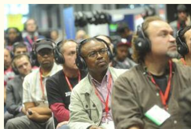
Delegates listen intently during Project Studio Expo session.

AES has a long history of serving the recording community, from the early days of monophonic vinyl to today’s modern multichannel digital audio formats. With the rise of project studios, home recordists