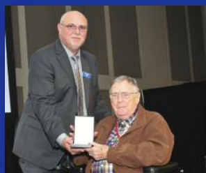
Gold Medal Award, Rudy van Gelder