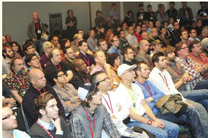
The game audio sessions consistently attracted large crowds, as seen in this workshop on breakthroughs for HTML5 and mobile.