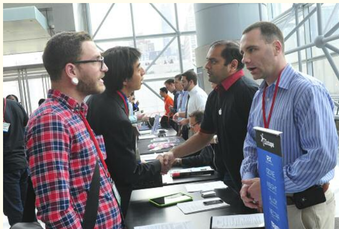
Students discuss audio job opportunities with prospective employers at the Career Fair.