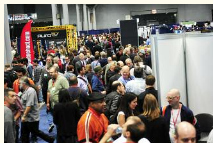
Visitors through the aisles of the exhibition