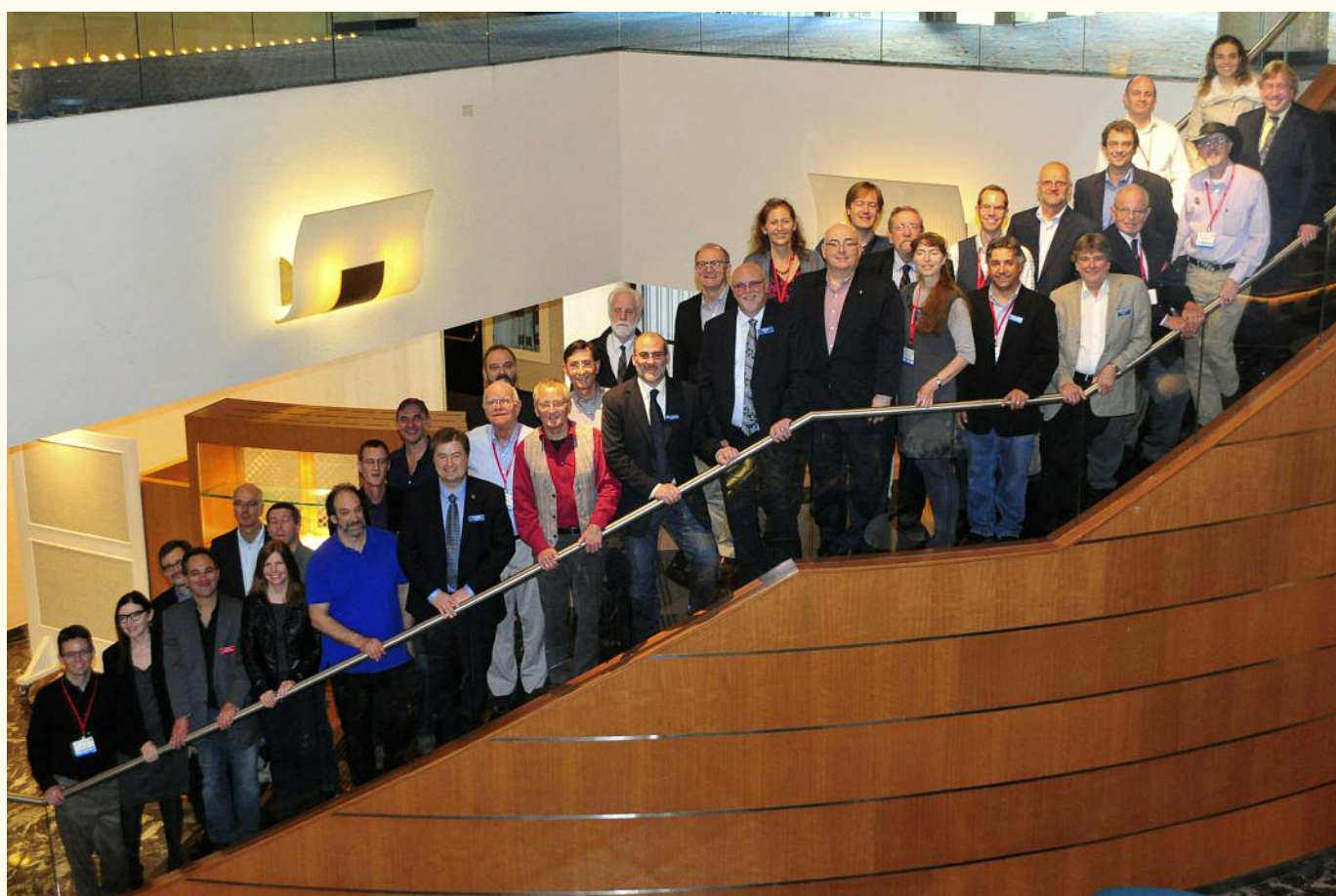
The AES Board of Governors and committee chairs meet after the convention.