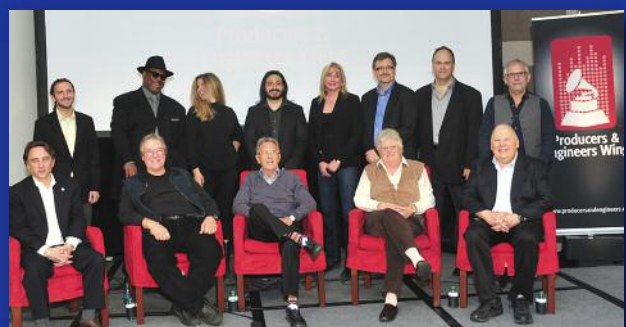
The Grammy Sound Table remembered Phil Ramone.