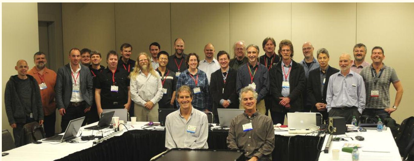
The AES-67 standards group celebrates the recent success of the launch of the network interoperability standard.