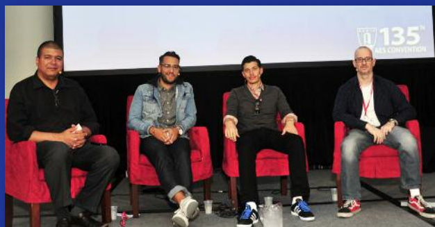
Platinum Producers panel