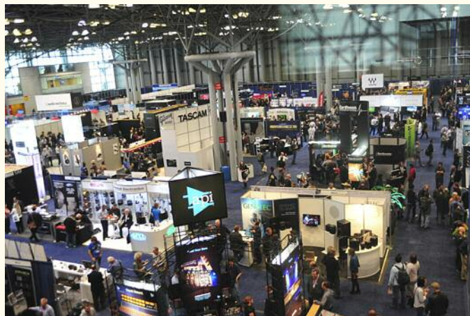
A birds-eye view of the exhibition floor

SSL brought out its new Live console aimed at FOH and stage monitoring sound production. It’s based on the company’s new Tempest processing platform and can have as many as 976 inputs with 192 processing paths working at