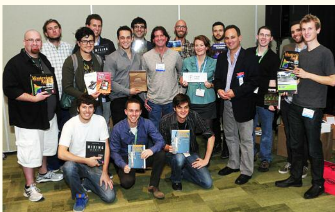
Student events in full swing: top, all ears for a valuable career-counseling session with industry pros, and bottom, an enthusiastic group of recording competition winners holding Focal Press books. Focal was just one of a large group of companies that donated prizes.