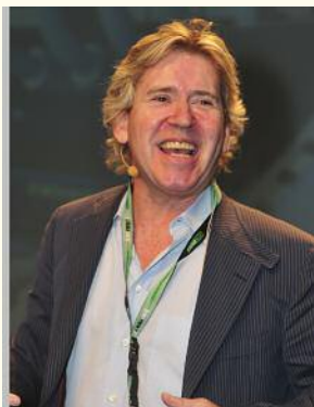
Steve Lillywhite, keynote speaker