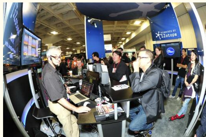
Visitors get involved at the iZotope booth.

Support from the business community extended beyond the exhibition floor, as a number of sponsors supported tracks of events in the technical program. THAT Corporation and Audio Precision returned as co-sponsors of the Product Design Track, as did Dolby as long-time sponsor of the Broadcast and Streaming Track. Renkus Heinz sponsored the Live Sound Track. Perhaps most notably, inMusic brands M-Audio and Akai Professional served as Convention Platinum Sponsors and were instrumental in bringing Young Guru to the event. Sponsors and exhibitors expressed themselves pleased