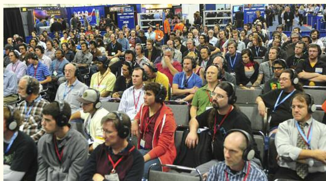
Crowds through the AES's first Project Studio Expo.

executive director, explained that the PSE represents a new direction for the AES, in bringing high-profile audio community leaders directly to end-users for training and mentorship. Senior editors from major trade publications enthusiastically endorsed the PSE in advance of the show and appeared together in a panel at the event.