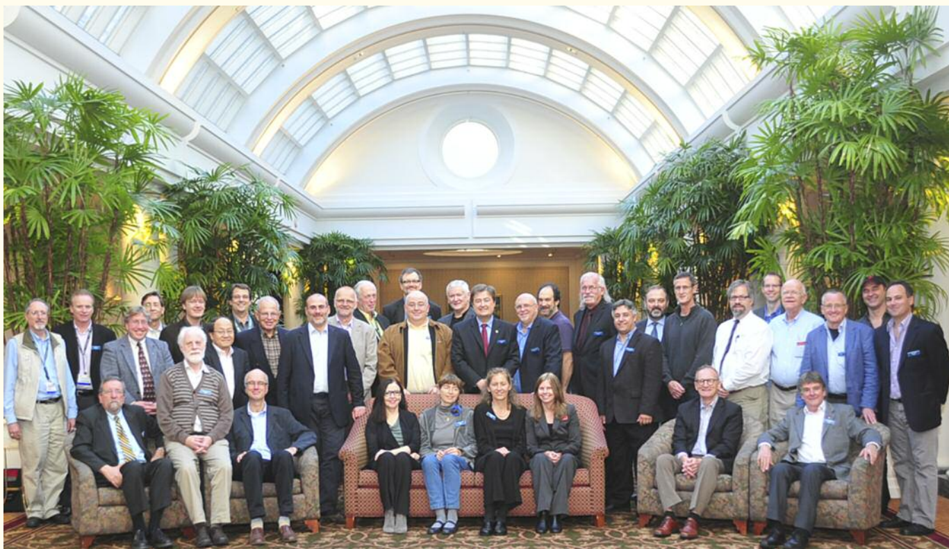
The AES Board of Governors take a photo break during its meeting on the final day of the convention.