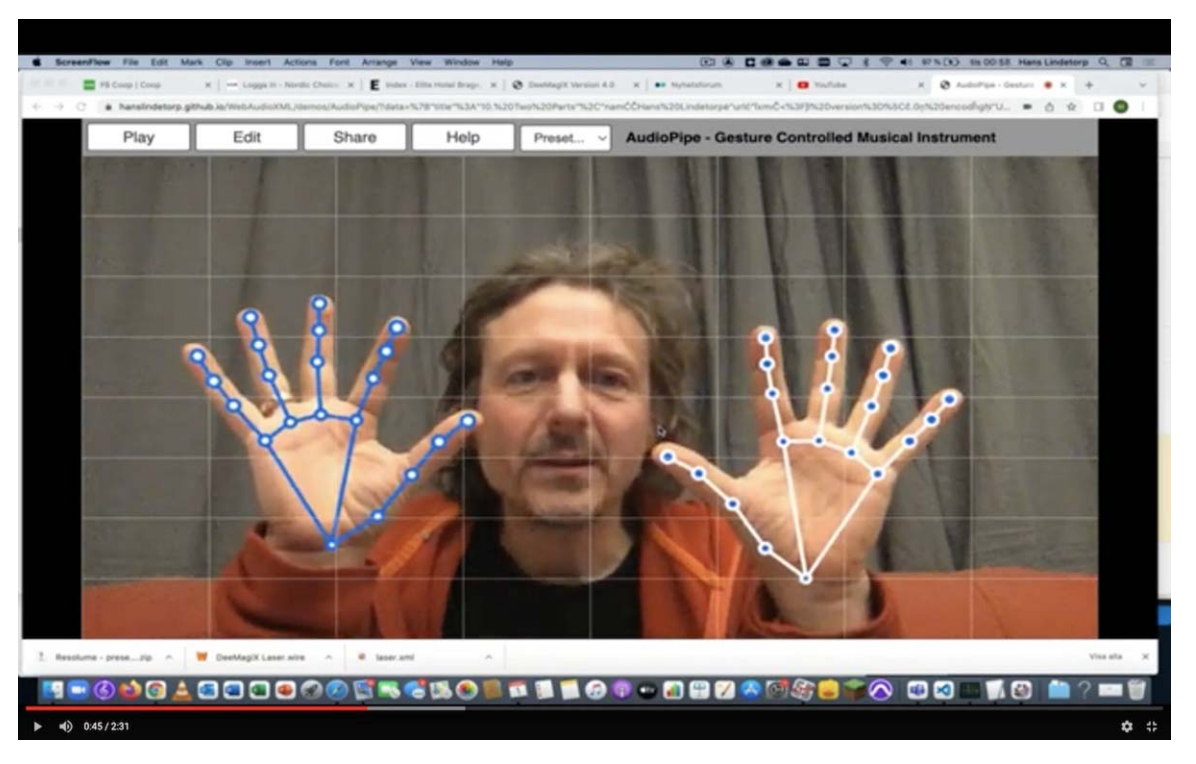
Fig. 2. The online interface used in the second evaluation showing the hand recognition feature in MediaPipe.